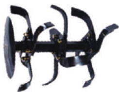
32 BLADES 2+1+1