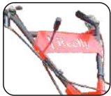
EASY GEAR SYSTEM