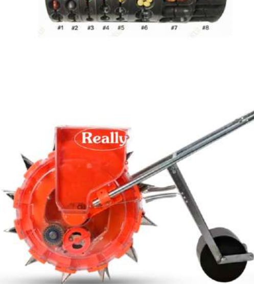
12T MANUAL SEEDER MODEL NO RAPL-MS-12TEETH