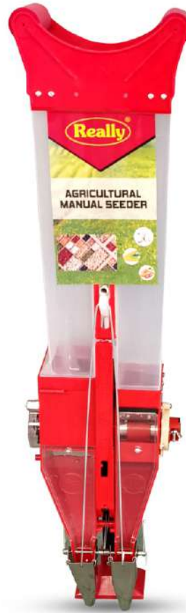
MANUAL PLANTER MODEL NO RAPL-MP