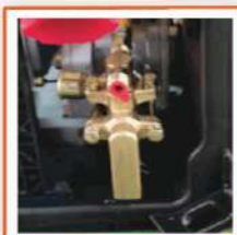
HEAVY BRASS PUMP