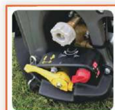
HUMANIZED QUICK SWITCH