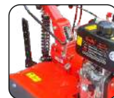
SHOCK ABSORB TECHNOLOGY