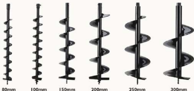
80mm 100mm 150mm 200mm 250mm 300mm