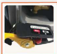
LATEST DESIGN WATER-PROOF SWITCH