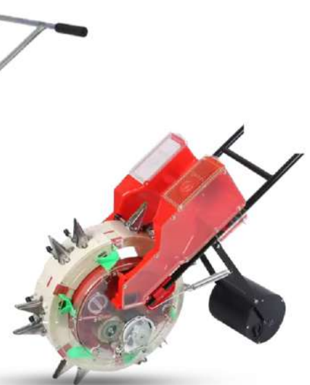
14T SEEDER CUM FERTILIZER MODEL NO RAPL-MS-14TEETH