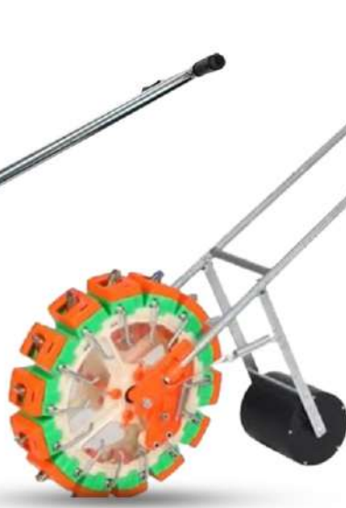
14 TEETH MULTI SEEDER MODEL NO RAPL-MS-14T-MULTI