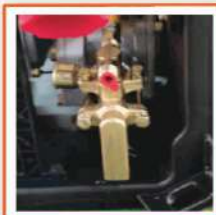
HEAVY BRASS PUMP