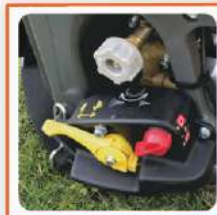
HUMANIZED QUICK SWITCH