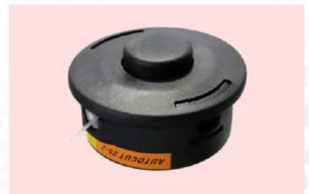
TRIMMER HEAD BLACK