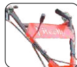
EASY GEAR SYSTEM