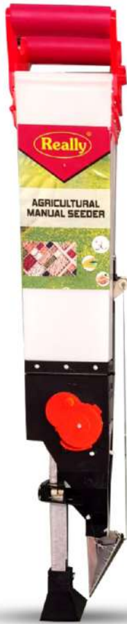
SINGLE SEEDER MODEL NO RAPL-MS-1S