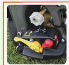
HUMANIZED QUICK SWITCH