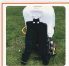
ERGONOMICS KNAPSACK DESIGN