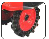
RADIAL TYRES 400-8