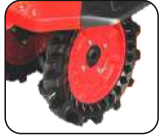
RADIAL TYRES 400-8