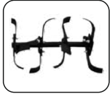
32 BLADES 2+1+1