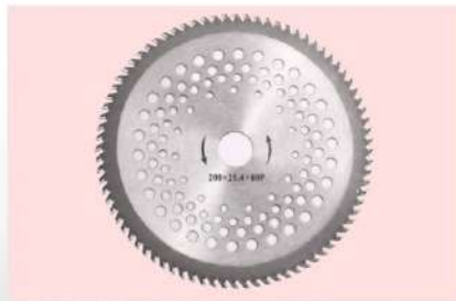
80T TCT BLADE