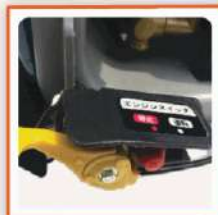
LATEST DESIGN WATER-PROOF SWITCH