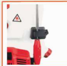
GUN HOLD SYSTEM