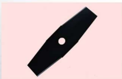
2T BLACK BLADE