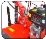
SHOCK ABSORB TECHNOLOGY