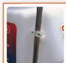
GUN HOLD SYSTEM