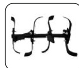
32 BLADES 2+1+1