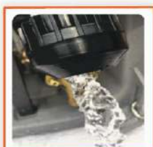
SMART LEAKAGE CAP